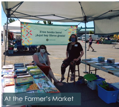
At the Farmer's Market

99,311 books, movies, & audiobooks circulated 36,039 electronic materials borrowed by registered patrons 400 interlibrary loans delivered 33,747 website visits 1,434 WiFi sessions